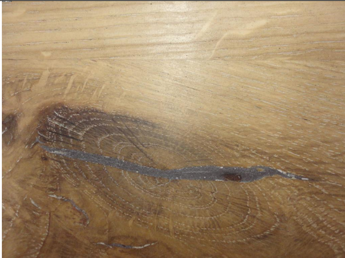
Cracks and knot are allowed too be filled with a contrast filler.