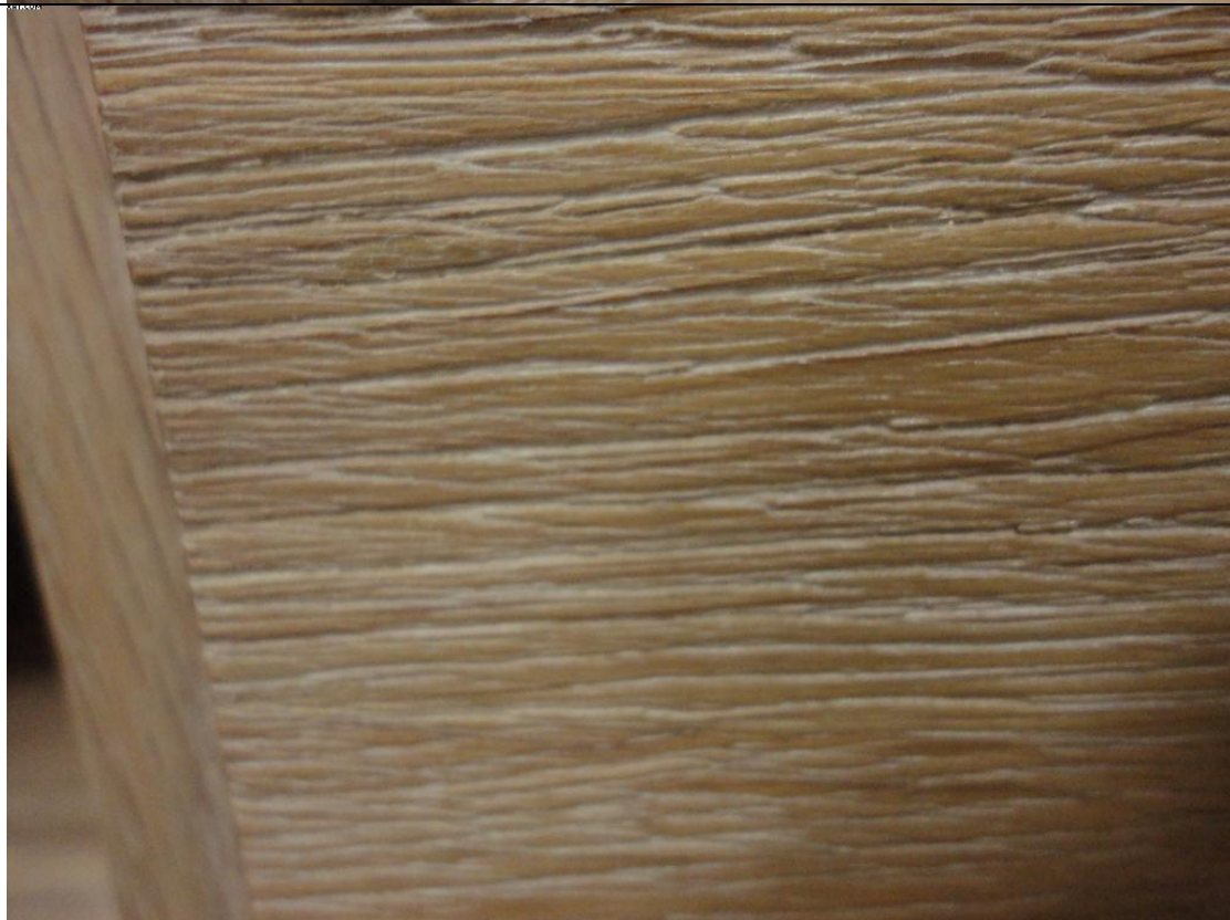
Brushed wood grain with residue of patina.