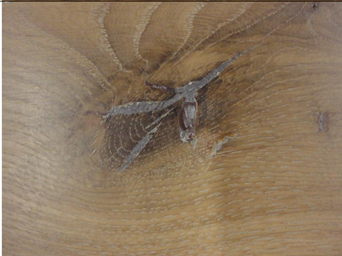
Cracks and knot are allowed too be filled with a contrast filler.