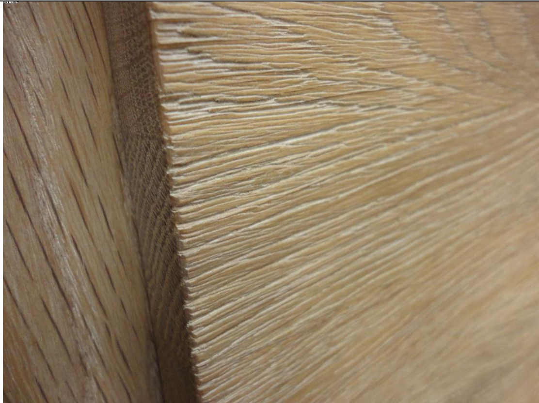
Brushed wood grain with residue of patina.