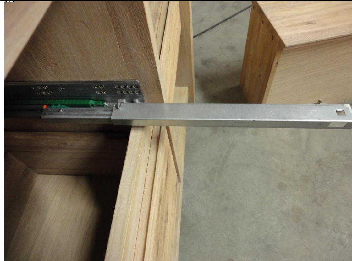
Invisible, soft closing drawer guides.