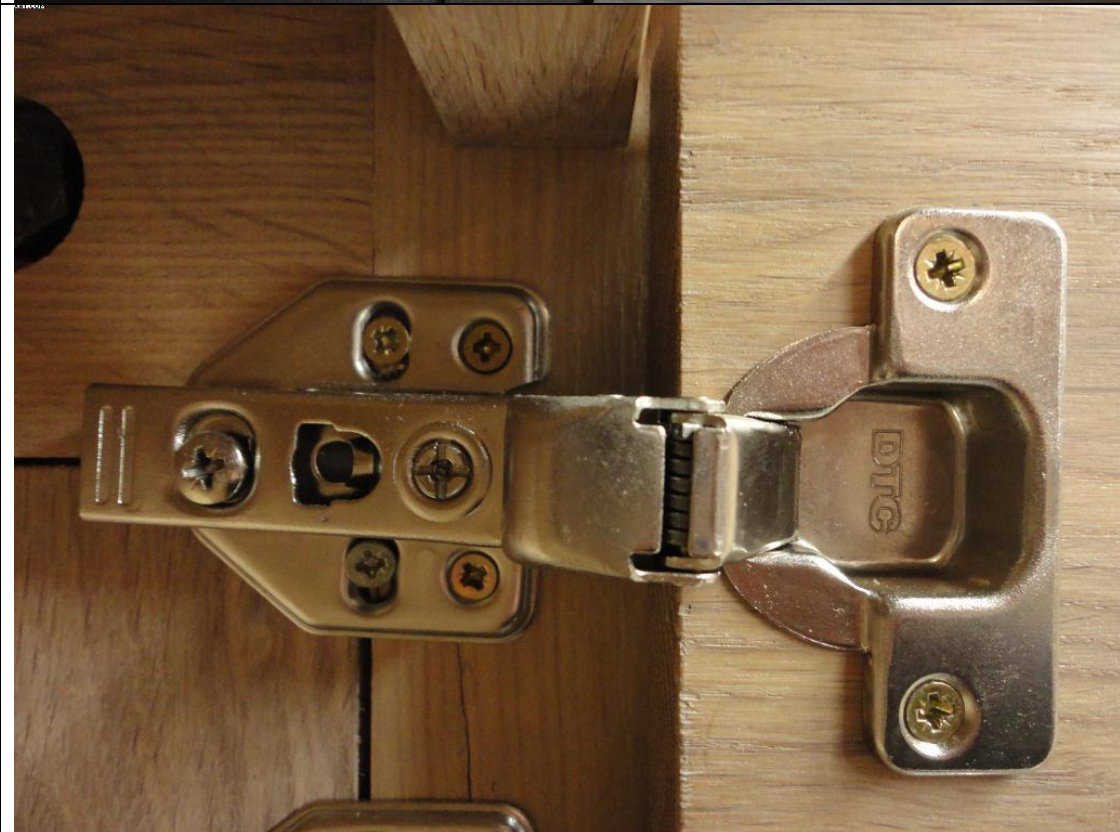
Soft closing kitchen hinges. Items with barlock will have normal kitchen hinges.