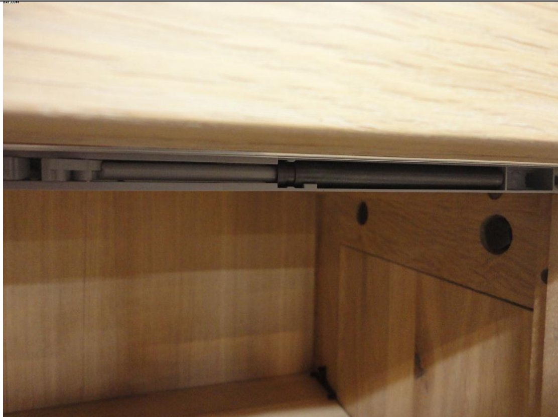
Soft closing system for sliding doors.