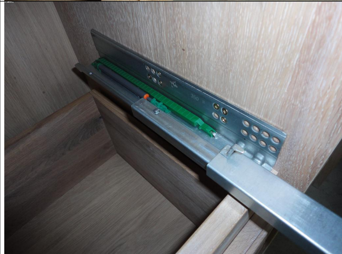
Invisible, soft closing drawer guides.