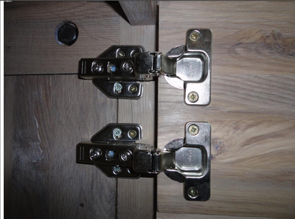
Soft closing kitchen hinges. Items with barlock will have normal kitchen hinges.