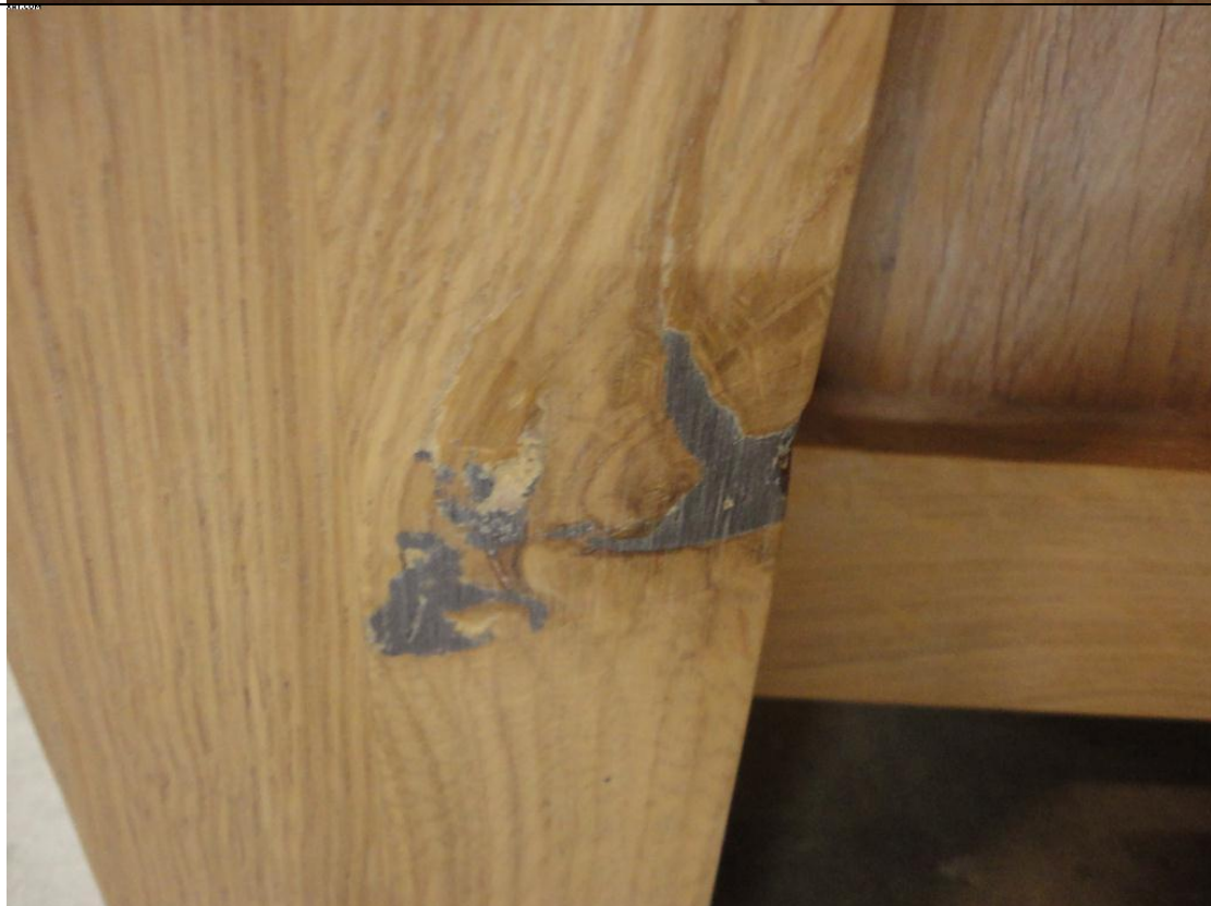
Cracks and knot are allowed too be filled with a contrast filler.